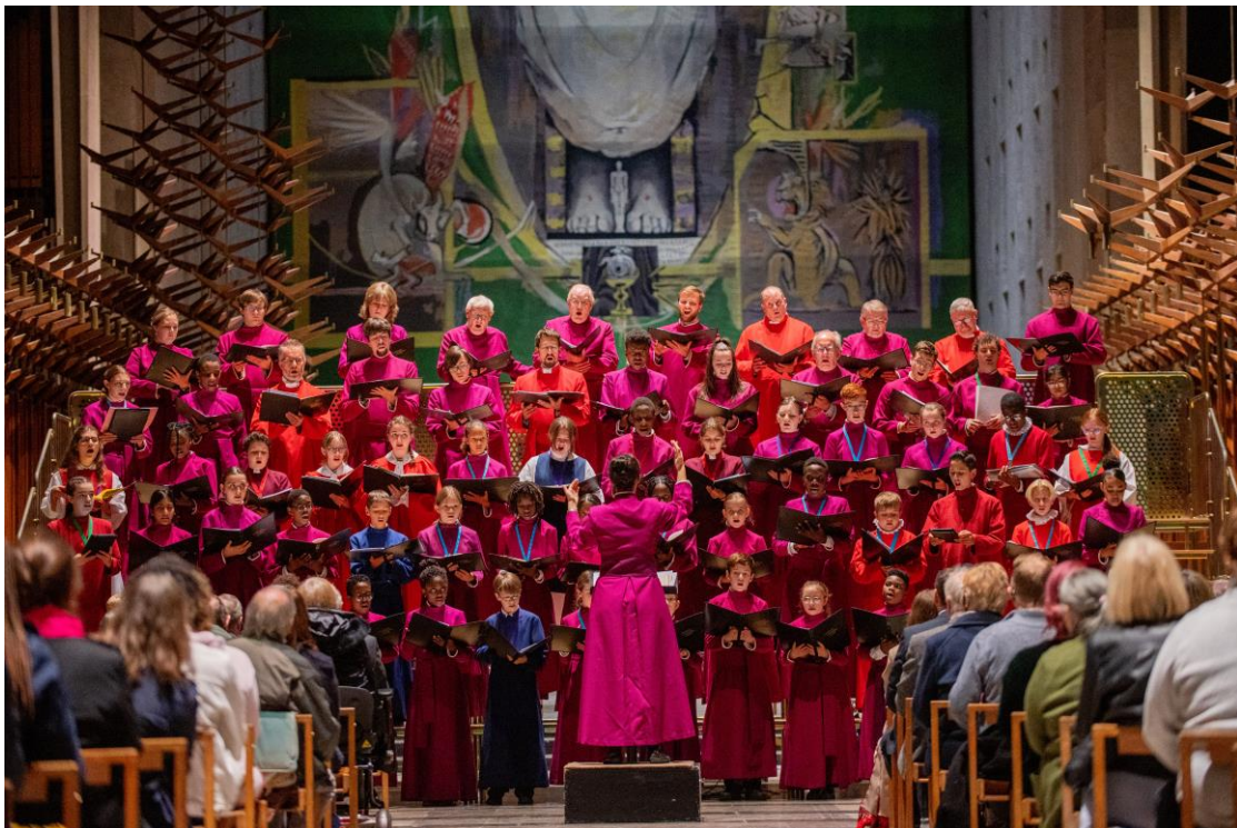
Cathedral Music Trust Diamond Fund concert in 2021

The Cathedral Choir - Two separate treble choirs (19 boys and 26 girls at present) who sing regularly by themselves and with the back rows, consisting of choral scholars, and volunteer and professional clerks. The Cathedral Choir is one of the most diverse choirs in the country and we are proud to recruit choristers from schools all over the city. The Lay Clerks' regular weekly schedule during term time is as follows: